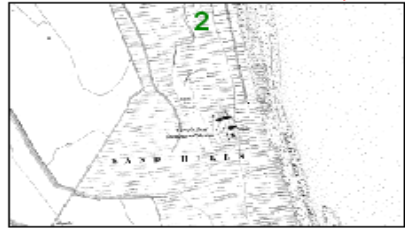
1894 - KENT 1:2,500