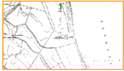
1877 - KENT 1:10,560

Please note that some maps have additional data which was added after the recorded publication date. Please see the FAQ section for more.